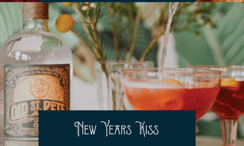
NEW YEARS KISS