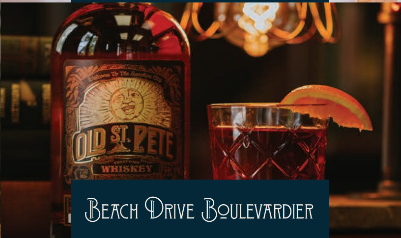
BEACH DRIVE BOULEVARDIER