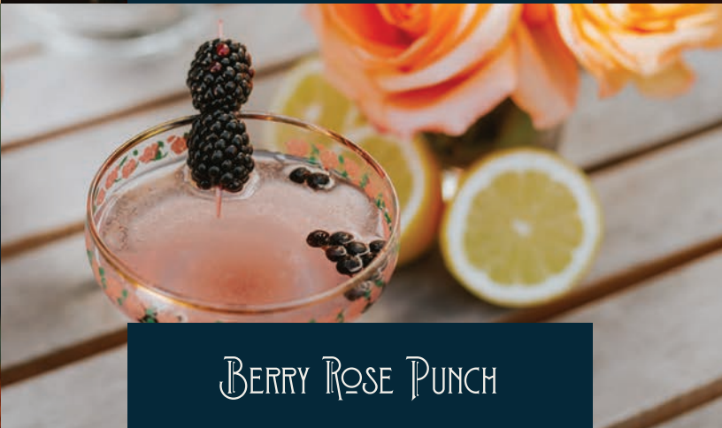
BERRY ROSE PUNCH