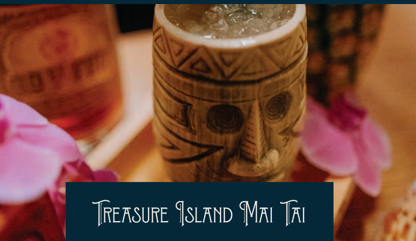
TREASURE ISLAND MAI TAI