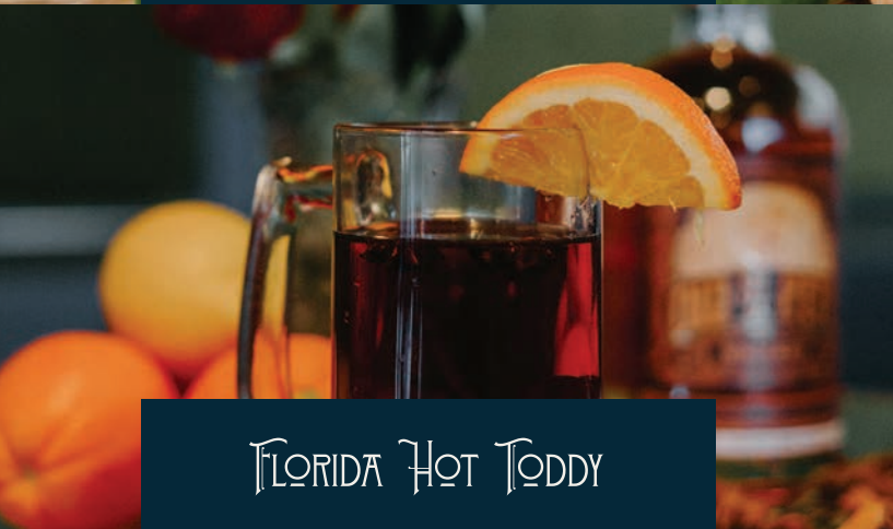
FLORIDA HOT TODDY